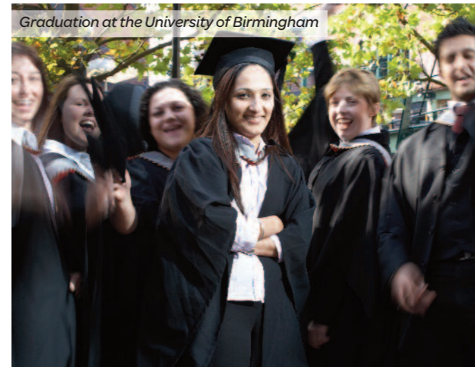
Graduation at the University of Birmingham

*Source: Cushman & Wakefield Q4 2010 Office Snapshot, based on average £55 per square foot/year in the London City area.