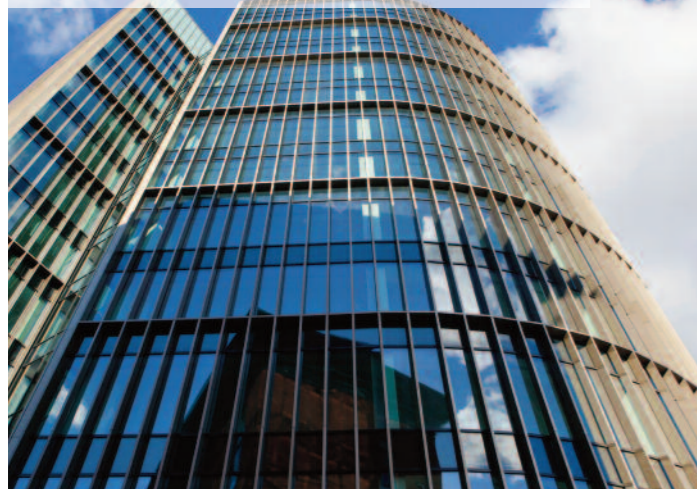
Eleven Brindleyplace, award-winning office development